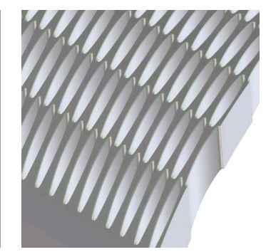
ECM permits holes to be machined into curved surfaces at oblique angles, which always leads to problems with conventional cutting methods.

ECM or electrochemical machining is a shape-reproducing process. The tool and workpiece are attached as electrodes to the positive and negative poles of an 8 to 20-volt DC source. The gap between the tool and the workpiece is between 0.05 and 2 mm. Through this gap, an aqueous electrolyte solution is pumped.