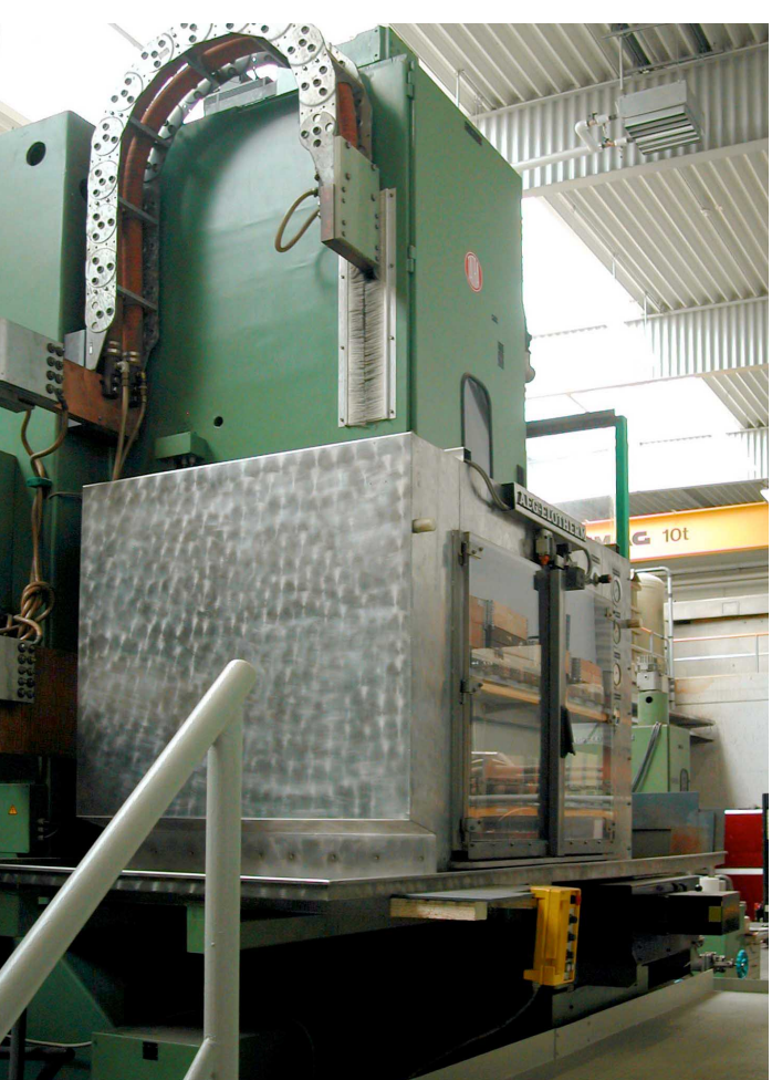
ECM machines produce fully ECM-machined, ready-to-use parts with units weights of 20 g to 4,000 kg.

2.5 mm wide x 7 mm long x 4 mm deep were produced in a single 2-minute operation at Köppern GmbH of Hattingen, Germany. Hole and surface structures of this type are quite common on aviation and power plant components. The materials used for such applications are hard-to-machine steels and special nickel-based alloys. The specific workpiece involved had a surface quality of R<sub>a</sub> 0.8 and a machining tolerance of \pm 0.1 mm. The hourly rate of ECM machine operation amounted to €210. Based on the net machining time of 2 min., each machining operation - producing 750 holes cost as little as 7 \in \text{or 1 cent} per hole.